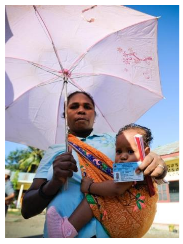
Woman Votes in Timorese Presidential Election

A woman shows her voter registration card at a polling station in Timor-Leste. Civil registration systems provide legal documents and facilitate people to participate in the society, including by enabling voting and ensuring the integrity of electoral lists.