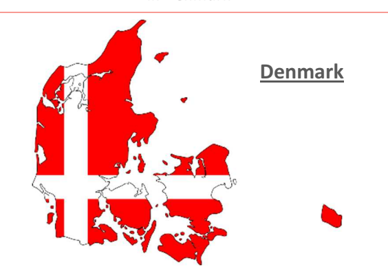
Figure 1: Civil registration and voter registration in Denmark

The connection between civil registration and voter registration matters because efficiency and accuracy are hallmarks of a well-functioning electoral process. In Denmark for example, elections can be held within a mere 21 days following an election notice. The Ministry for Economic Affairs and the Interior extracts information regarding eligible voters from the civil registry prior to an election. Each voter then receives a voter card in the mail showing them the election dates, times, and their individual polling places; making the management well-organized, efficient and granting the Ministry the ability to conduct its affairs quickly and at low cost.