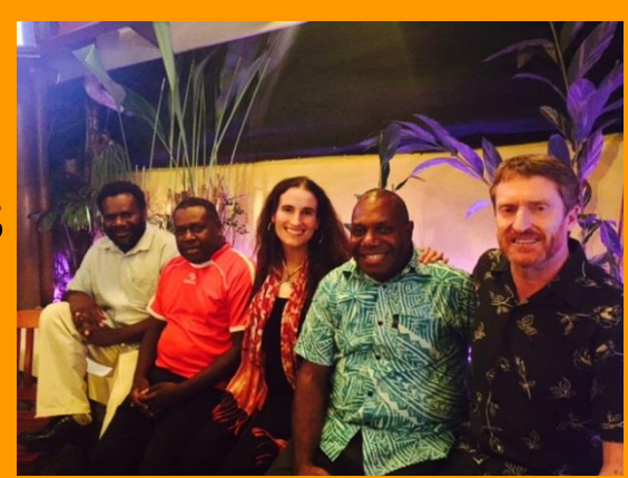
Pacific Civil Registrar Network