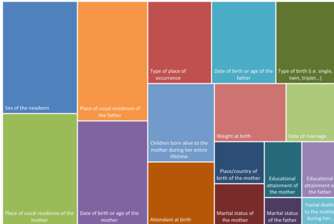
Live births - Core topics